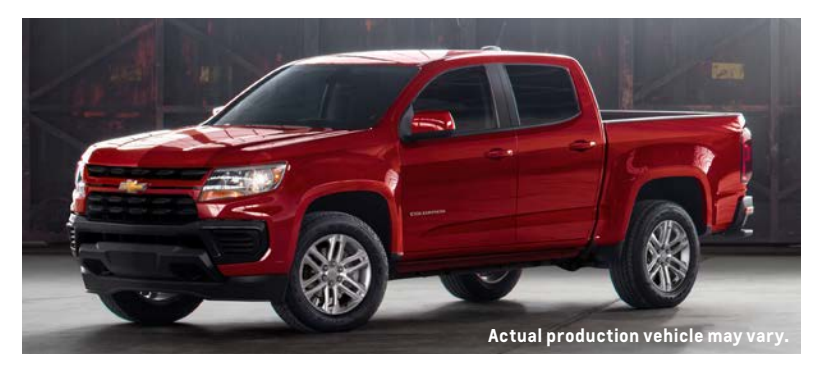
Custom Special Edition in Cherry Red Tintcoat (no longer available).