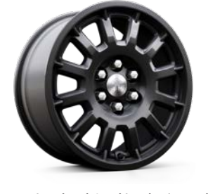
17" AEV-Designed Dark Graphite Aluminum Wheels Available on ZR2 with ZR2 Bison Edition