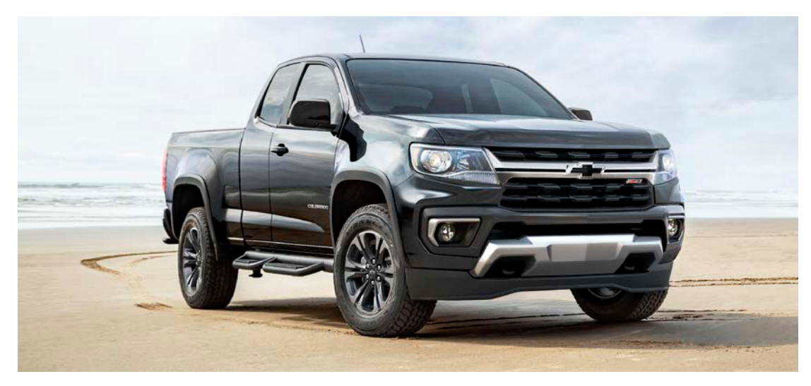
Colorado Extended Cab Z71 in Black with available Chevrolet Accessories.

1 EPA-estimated MPG city/highway: Colorado 2WD with available Duramax 2.8L Turbo-Diesel engine 20/30. 2 Requires Colorado Crew Cab Short Box LT 2WD with available Trailering Package, LT Convenience Package and Safety Package. Maximum trailering ratings are intended for comparison purposes only. Before you buy a vehicle or use it for trailering, carefully review the Trailering section of the Owner's Manual. The trailering capacity of your specific vehicle may vary. The weight of passengers, cargo and options or accessories may reduce the amount you can trailer. 3 Vehicle user interface is a product of Apple and its terms and privacy statements apply. Requires compatible iPhone and data plan rates apply. 4 Vehicle user interface is a product of Google and its terms and privacy statements apply. Requires the Android Auto app on Google Play and a compatible Android smartphone. Data plan rates apply. You can check which smartphones are compatible at g.co/androidauto/requirements. 5 Non-GM warranty. See your dealer for limited warranty details.