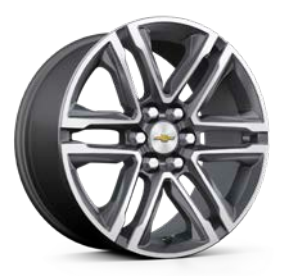
18" Dark Argent Metallic-Painted Aluminum Wheels Available on WT with Custom Special Edition

1 Safety or driver assistance features are no substitute for the driver's responsibility to operate the vehicle in a safe manner. Read the vehicle Owner's Manual for important feature limitations and information. 2 To avoid the risk of injury, never use recovery hooks to tow a vehicle. For more information, see the Recovery Hooks section of your Owner's Manual. 3 Chevrolet Infotainment System functionality varies by model. Full functionality requires compatible Bluetooth and smartphone, and USB connectivity for some devices.