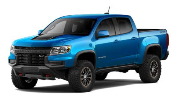
Bright Blue Metallic1