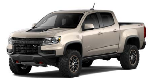
Sand Dune Metallic