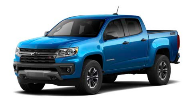
Bright Blue Metallic1