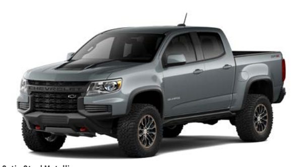
Satin Steel Metallic