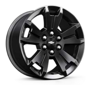
17" Gloss Black-Painted Aluminum Wheels Available on Z71 with Z71 Midnight Edition