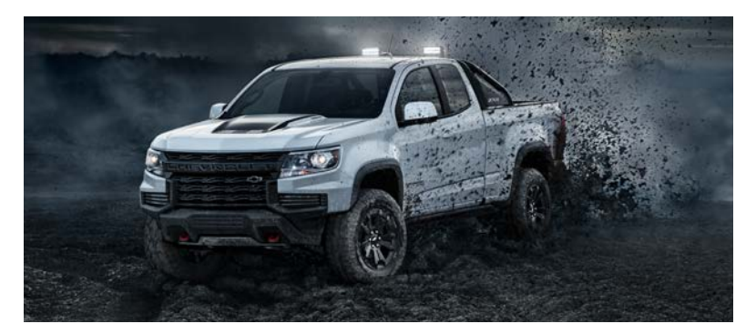
ZR2 Dusk Special Edition.