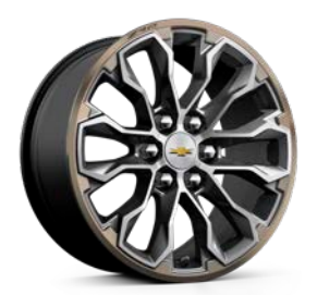
17" Graphite and Oxide Gold Aluminum Wheels Standard on ZR2