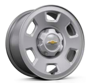
17" Ultra Silver Metallic-Painted Steel Wheels Standard on WT