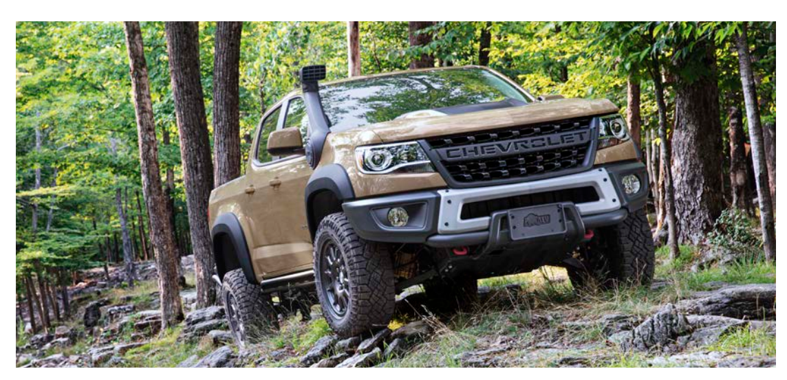
Colorado Crew Cab ZR2 in Sand Dune Metallic with available ZR2 Bison Edition and available accessories?