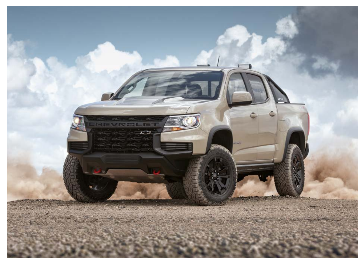
Colorado Crew Cab ZR2 in Sand Dune Metallic with available ZR2 Dusk Special Edition. Vehicle shown can tow up to 5,000 lbs2-3

The 2022 Colorado delivers everything you could ask for in a midsize pickup. Engine choices that are powerful and efficient, including an available GM-exclusive Duramax® 2.8L Turbo-Diesel engine that provides up to 7,700 lbs. of towing<sup>1,2</sup> muscle. A ZR2 off-road beast with the capability to conquer tough trails. And a comfortable interior filled with convenience and technology features. So go ahead. Choose your best life in Colorado.