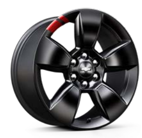
18" Black-Painted Aluminum Wheels with Red Accents Available on LT with Redline Edition

1 Safety or driver assistance features are no substitute for the driver's responsibility to operate the vehicle in a safe manner. Read the vehicle Owner's Manual for important feature limitations and information. 2 To avoid the risk of injury, never use recovery hooks to tow a vehicle. For more information, see the Recovery Hooks section of your Owner's Manual. 3 Chevrolet Infotainment System functionality varies by model. Full functionality requires compatible Bluetooth and smartphone, and USB connectivity for some devices. 4 Available on Crew Cab models only. Requires available Luxury Package.