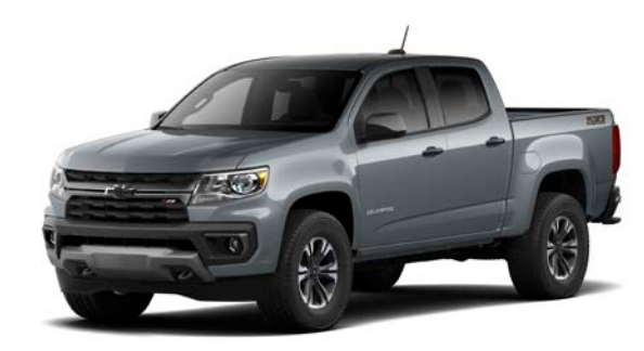
Satin Steel Metallic