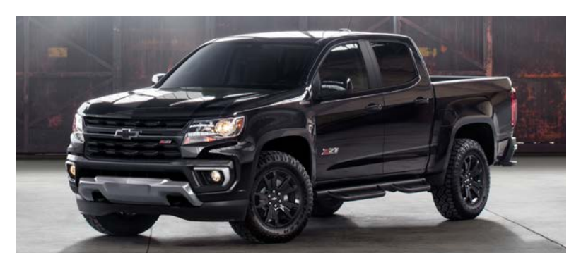
Z71 Midnight Edition.