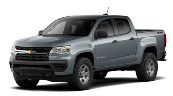
Satin Steel Metallic