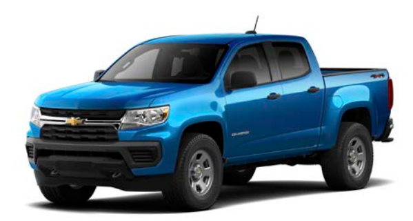
Bright Blue Metallic<sup>1</sup>