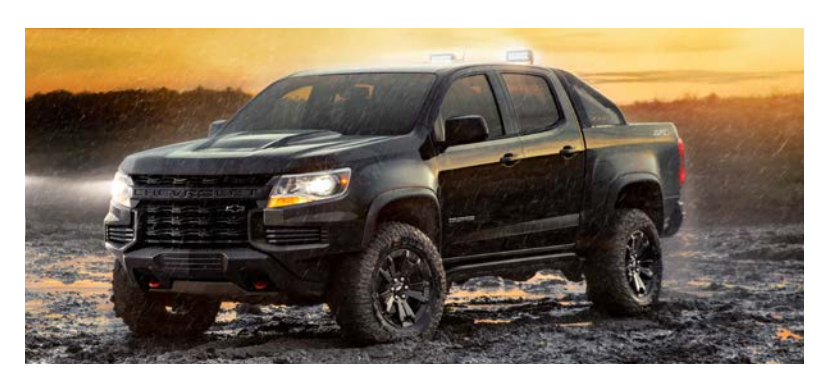
ZR2 Midnight Special Edition.

\underline{\textbf{1}} Non-GM warranty. See your dealer for limited warranty details.