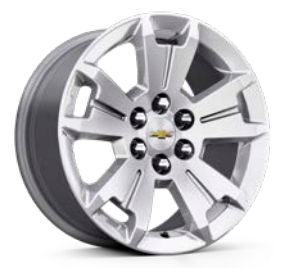
17" Blade Silver Metallic-Painted Aluminum Wheels Standard on LT