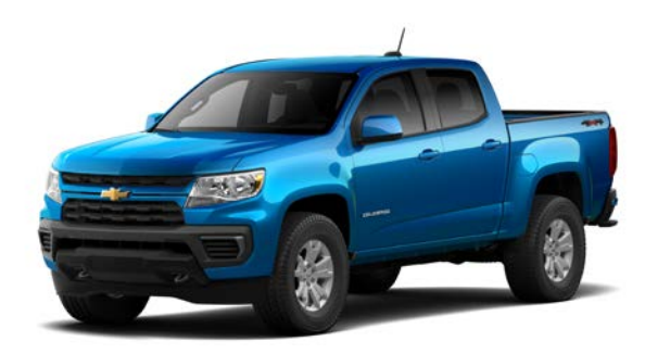
Bright Blue Metallic<sup>1</sup>