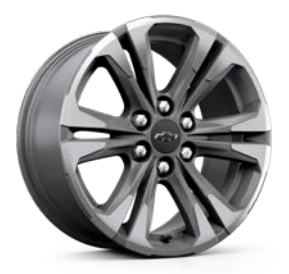
17" Bright Machined-Aluminum Wheels Standard on Z71