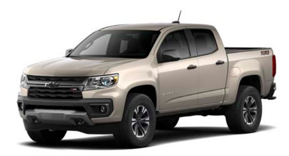
Sand Dune Metallic