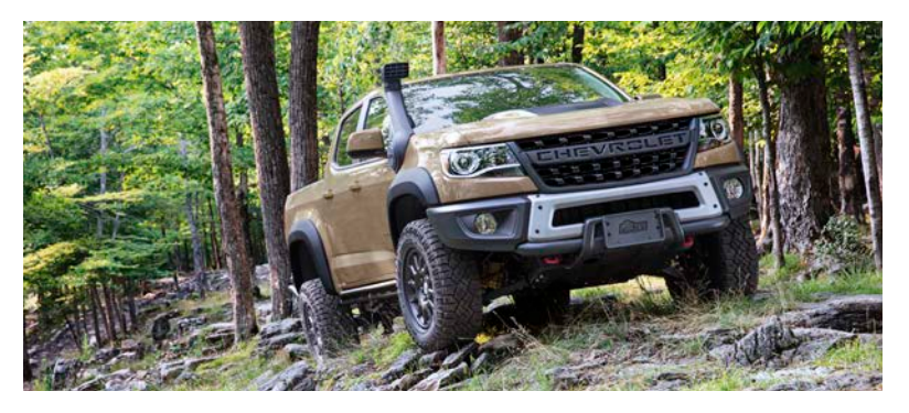
ZR2 Bison Edition (shown with available accessories¹).