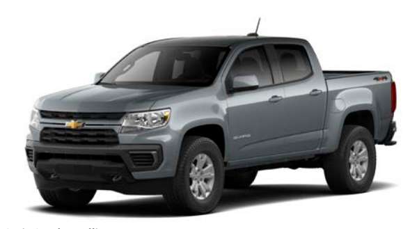
Satin Steel Metallic