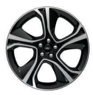
20" Bright-Machined Aluminum with High-Gloss Black-Painted Pockets Standard

Ebony & Brunello Leather with Perforated Inserts / 1-6