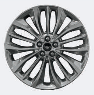
20" Polished Aluminum Titanium Elite Package Included

Ebony & Brunello Leather with Perforated Inserts / 1-5, 8, 9