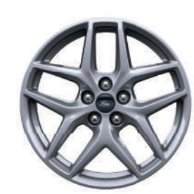
18" Split-Spoke Sparkle Silver-Painted Aluminum Optional