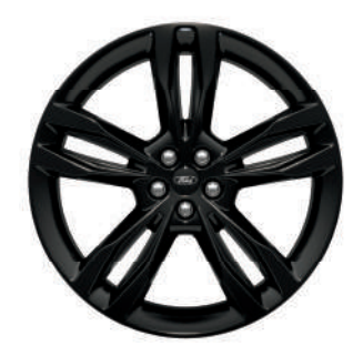
21" Premium Gloss Black-Painted Aluminum Optional

1 Agate Black Metallic 2 Carbonized Gray Metallic 3 Stone Blue Metallic<sup>4</sup> 4 Forged Green Metallic 5 Rapid Red Metallic Tinted Clearcoat<sup>4</sup>