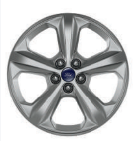
18" Sparkle Silver-Painted Aluminum Standard