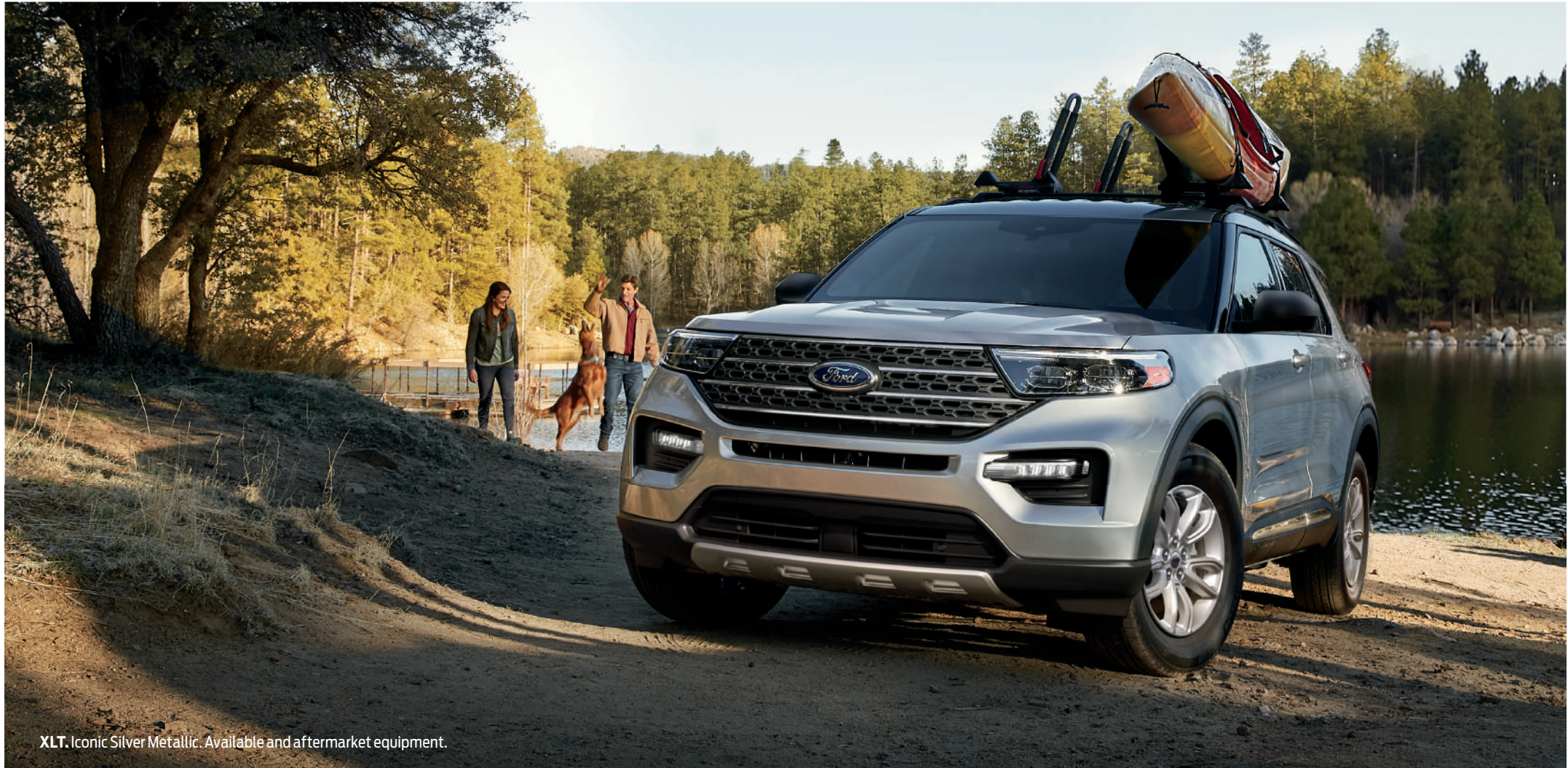
XLT. Iconic Silver Metallic. Available and aftermarket equipment.

At first glance, you can't help but notice the distinctive black mesh grille with chrome bars and signature LED headlamps that make this vehicle a standout. Take a closer look inside, and appreciate the leather-wrapped steering wheel and high-end ActiveX™ Trimmed Seats. And, with standard features like a 10-way power driver's seat, and a 2nd-row 35/30/35 split fold-flat seat with E-Z Entry, it's easy to see why XLT is such a popular choice.