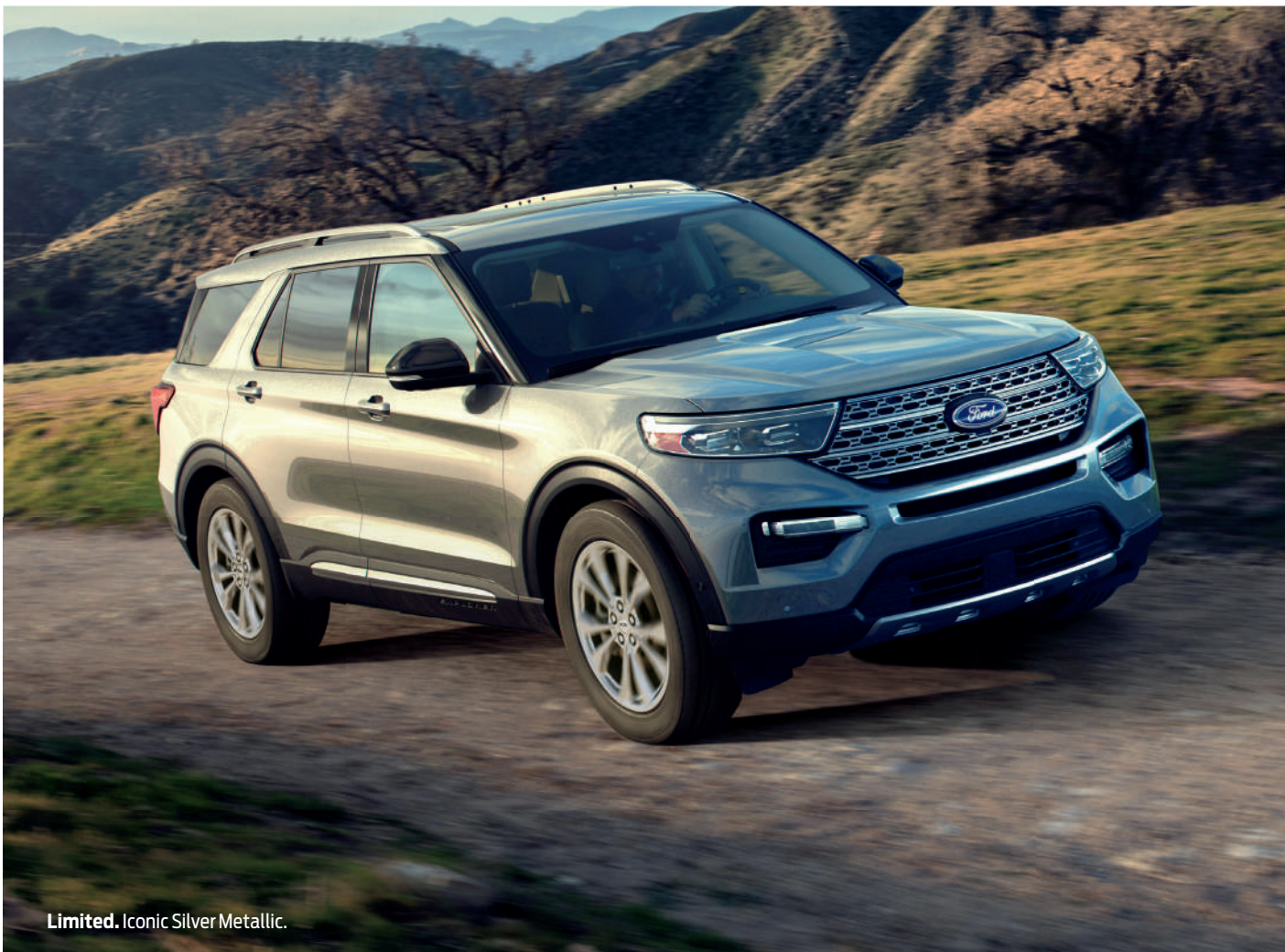
Limited. Iconic Silver Metallic.

Not all roads are created equal, but Ford Explorer SUV levels the playing field with Selectable Drive Modes. Rear-wheel-drive Explorer models offer 6 modes, while available Intelligent 4WD with the Terrain Management System™ offers 7 modes that are easily selected with a simple turn of a dial.