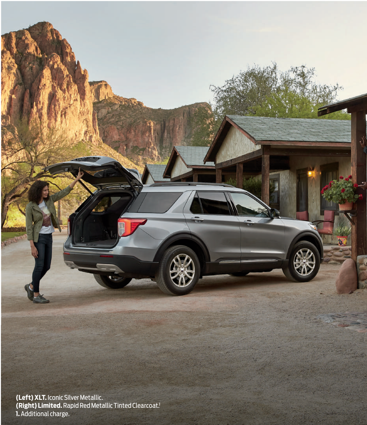
(Left) XLT. Iconic Silver Metallic. (Right) Limited. Rapid Red Metallic Tinted Clearcoat! 1. Additional charge.