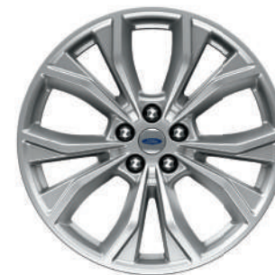
20" PREMIUM PAINTED ALUMINUM Standard

Ebony Leather with Perforated Inserts / 1-10