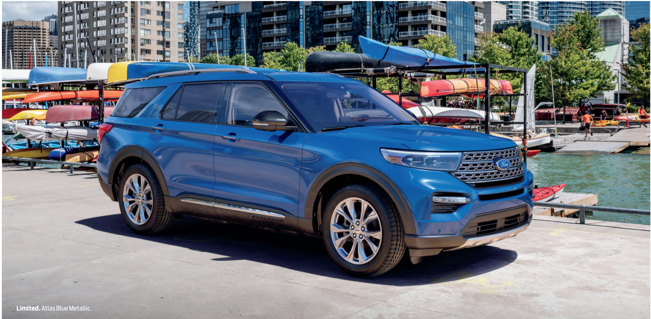
Limited. Atlas Blue Metallic.

A simple press of a button quickly folds down the 3rd-row seat to give you more room. And a 360-Degree Camera with Split-View Display helps you navigate tight spots with ease. In Explorer, there's no limit to convenience.