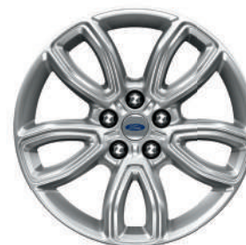
18" PAINTED ALUMINUM Standard